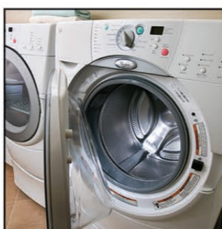
MWDOC has facilitated the installation of more than 53,000 high efficiency clothes washers countywide, which has saved nearly 5,000 acre-feet of water.

Through leadership and representation at Metropolitan, MWDOC works to ensure water reliability and economic efficiencies for Orange County. This includes strong advocacy on issues such as water resource planning, design of Metropolitan facilities, development of imported water rates and charges, and sponsorship of statewide water policy that supports regional reliability. MWDOC has secured more than $260 million for programs that support and improve Orange County's system reliability and reduce our dependence on imported water supplies. In addition, MWDOC and its client agencies have become recognized leaders in water use efficiency and recycling.