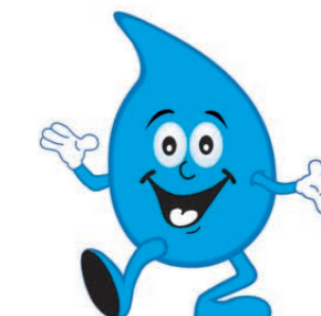
School Program mascot Ricki the Rambunctious Raindrop reminds Orange County students to save water year-round.