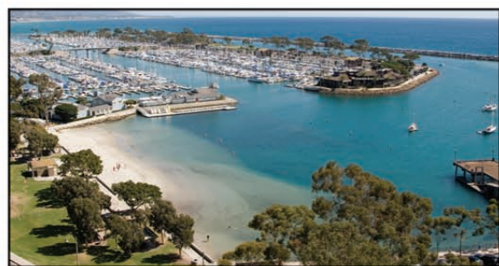
Dana Point Harbor is located just north of the proposed South Orange Coastal Ocean Desalination Project, which is currently under study.

WHAT WE DO The Municipal Water District of Orange County is committed to providing a reliable supply of high quality water for Orange County. Working closely with Metropolitan and our client agencies, our staff looks for opportunities to improve Orange County's water resources and reliability. By integrating local planning challenges and regional stakeholder partnerships, MWDOC maximizes water system reliability and overall system efficiencies. We work to expand Orange County's water supply portfolio by providing planning and local resource development expertise in the areas of recycled water, groundwater, ocean water, and conservation. One example of these efforts is the South Orange Coastal Ocean Desalination Project, which seeks to develop south Orange County's local water supplies. Providing our client agencies with value-added services, we offer assistance with demand projections, mapping, urban water management planning, rate structure development, and water shortage mitigation plans.