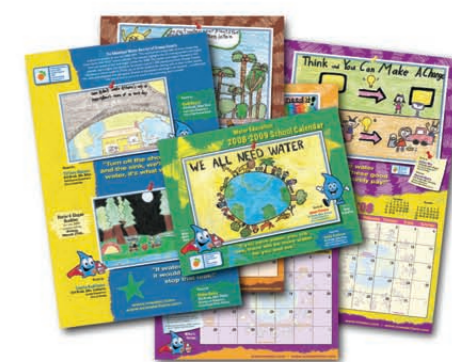
More than 15,000 copies of the Water Education School Calendar are printed and distributed to Orange County schools each year.

MWDOC is a longtime leader in water education for students. We were one of the first water districts in California to offer a water education school program when the program launched in 1973. Today, through a partnership with Discovery Science Center, we have provided nearly three million Orange County students with grade-specific lessons that focus on topics like the water cycle, forms of water, and water as an environmental resource. Another feature of our education program is the annual Poster and Slogan Contest, which encourages students to express ways to save water through drawings or words. The winning posters and slogans are featured in an annual water education calendar that is distributed to Orange County elementary schools. Encouraging students to save 20 gallons of water per day, the O.C. Water Hero program (co-sponsored by Orange County Water District) provides students with water conservation kits to make saving water fun.