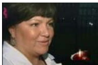
Residents begin remembrances at Ford ... Jul 9, 2011