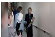
Betty Ford Obituary Jul 8, 2011