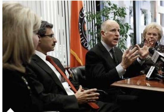
Gov. Jerry Brown and members of the Orange County Business Council address the media after their meeting.

PRINT E-MAIL SHARE COMMENTS (35) FONT SIZE: - +